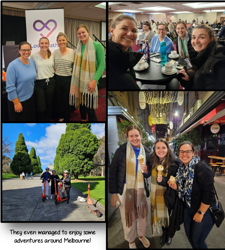
They even managed to enjoy some adventures around Melbourne!

PS—They wont tell you but I will...they are so passionate about their improvement, they funded their own flights !!